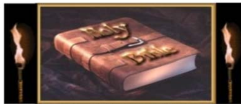
Yahshua Messiah's Sabbath Day Ministry C/O general delivery USPO Waxahachie, Texas 75165